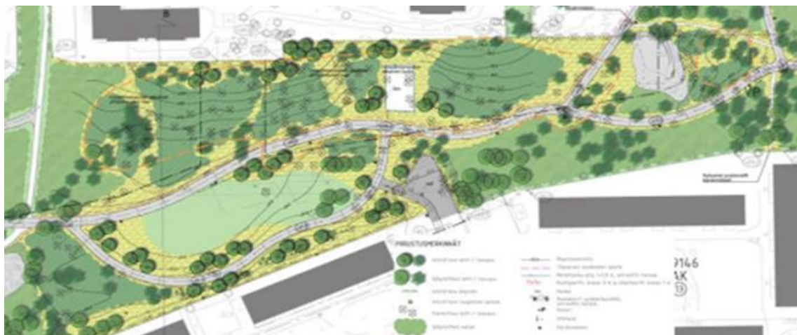
The plan of Ida Aalberg park. Partial copy of the area where surplus soils are utilized.