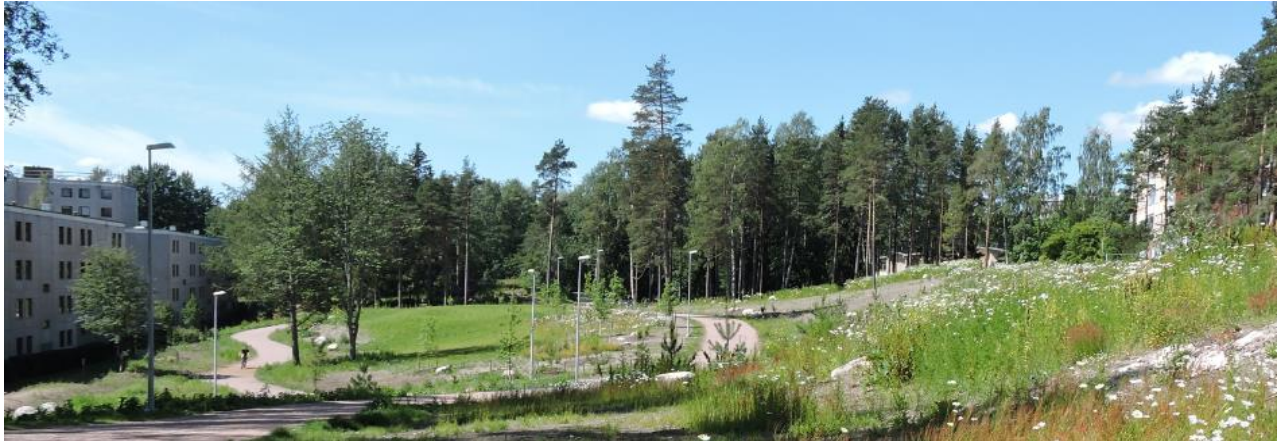
Picture of finished Ida Aalberg park (top) and cross section of park (below).