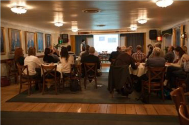
Figure 1. Absoils presentation at Baltic Inert Material Management Symposium held in Stockholm (2011)