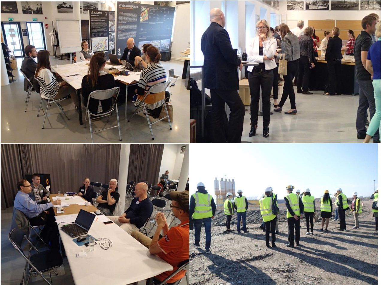
Figure 4-9. Absoils international seminar in Helsinki (2014)