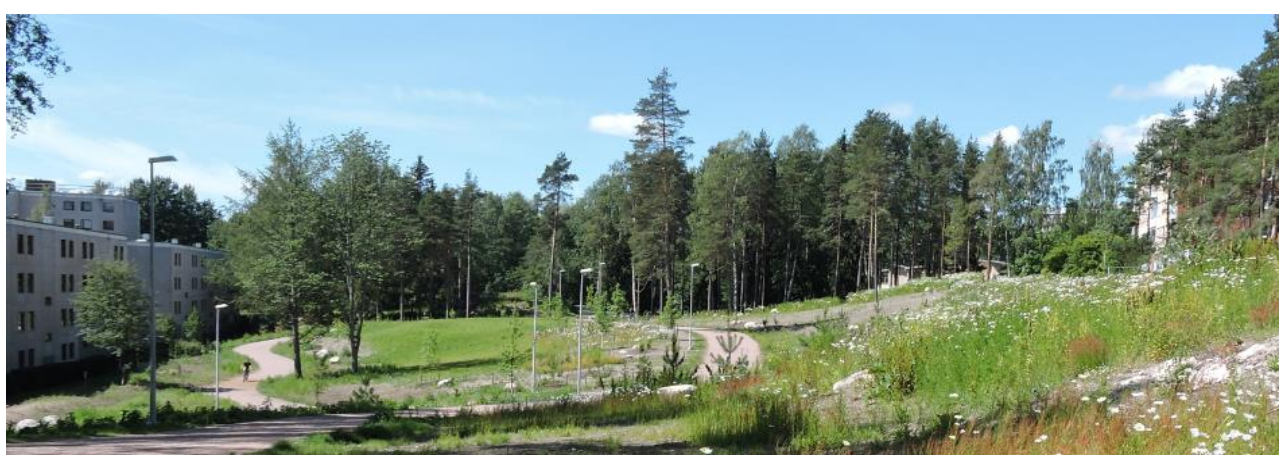
Picture of finished Ida Aalberg park (top) and cross section of park (below).