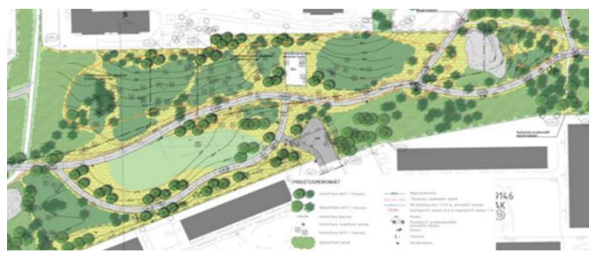
The plan of Ida Aalberg park. Partial copy of the area where surplus soils are utilized.